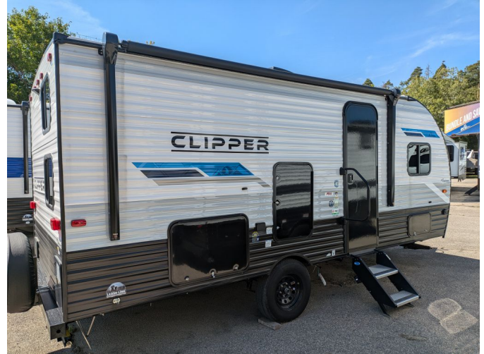
182DBU FLOORPLAN 4K Series