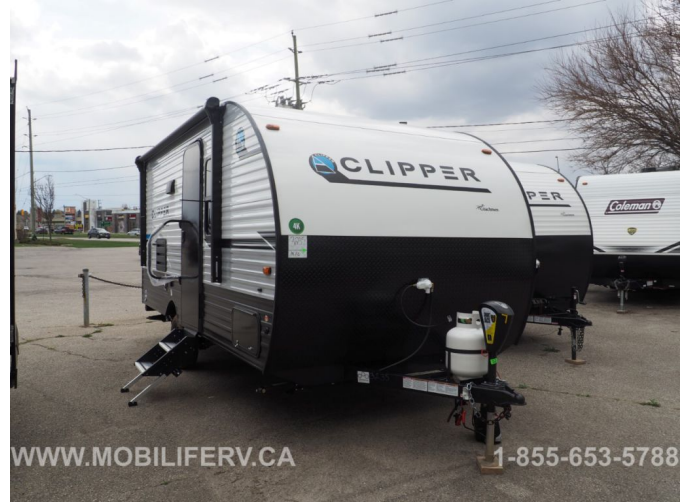
18FQ FLOORPLAN 4K Series

Disclaimer: Product information, pricing and photos are as accurate as possible and are subject to change without notice.