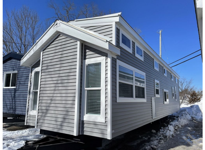
Elevation Park Model Company Canadian Floorplan 5-114CA